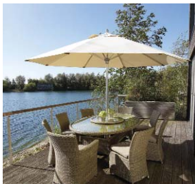
Furniture & BBQs