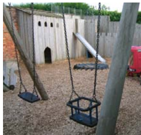
Children's play area