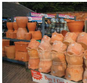
Indoor & outdoor pots