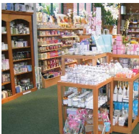
Gifts & cards