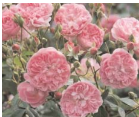
Indoor & outdoor plants